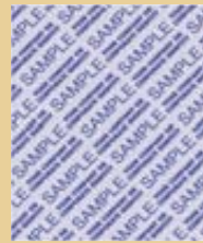
Discreet Sheet (optional)